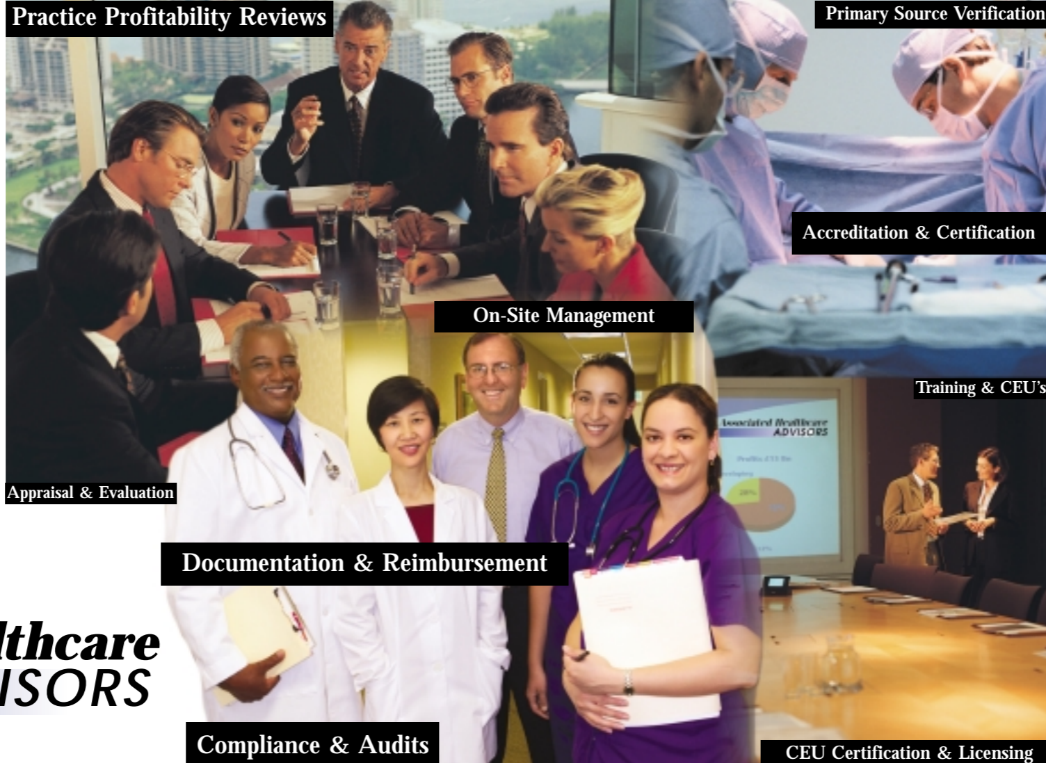
Practice Profitability Reviews

We can provide compliance programs and resources to assess and prevent potential liability. In the current environment of recoupement and fraud investigations by the Office of Inspector General, internal compliance programs are essential to reduce your risk. to accompany you home.